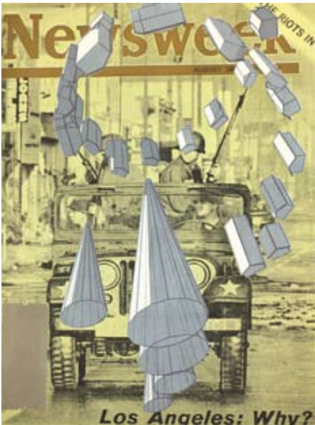
Beyond the Great Eclipse: Newsweek the Riots in Color, 2009 Direct to plate photogravure and aquatint; Paper size: 25" x 17.5"; Edition of 20

Arceneux is the Director of the Watts House Project (WHP), an ongoing collaborative artwork in the shape of a neighborhood redevelopment centered around the historic Watts Towers in Watts, California. WHP engages art and architecture as a catalyst for expanding and enhancing community. The neighborhood surrounding the Watts Towers presents a stark contrast to the well-maintained aesthetics of this national monument, and currently the residents have limited means