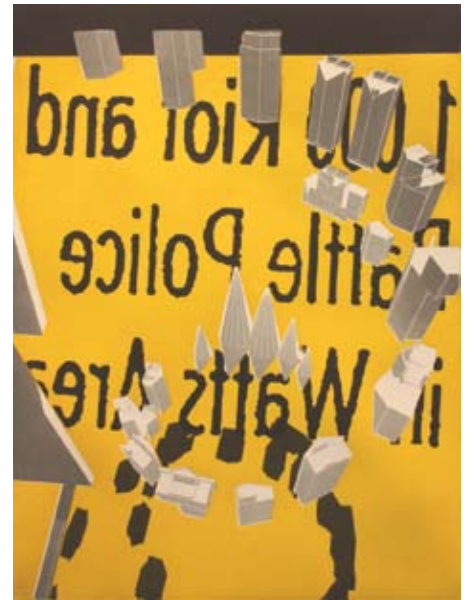
Beyond the Great Eclipse: 1000 Riot, 2009 Direct to plate photogravure and aquatint; Paper size: 25" x 17.5"; Edition of 20