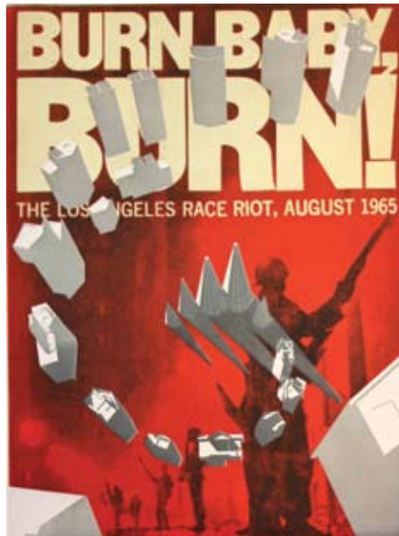
Beyond the Great Eclipse: Burn Baby Burn, 2009 Direct to plate photogravure and aquatint; Paper size: 25" x 17.5"; Edition of 20